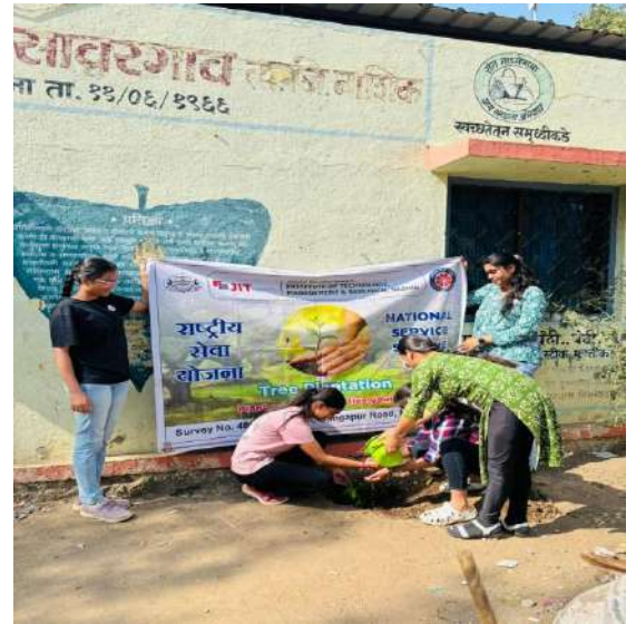
Tree Plantation by NSS Students volunteers.