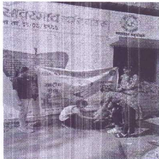
Tree Plantation by NSS Students volunteers.