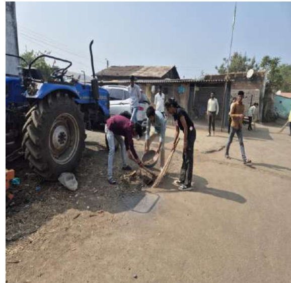
Cleanliness drive near Zilla Parishad school