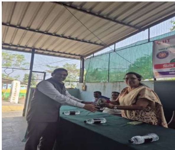
Chief Guest Felicitation