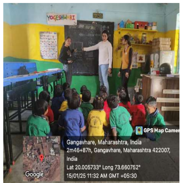
Introduction of Computer and Basic of Computer Education drive conducted by NSS Volunteers In Z.P. School