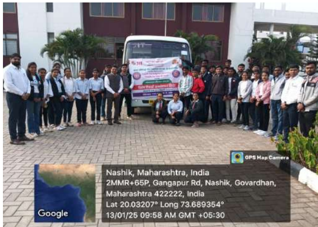
Departure For NSS Special Camp From College Campus.