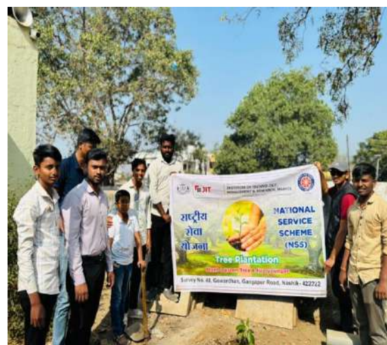
Tree Plantation by NSS Students volunteer