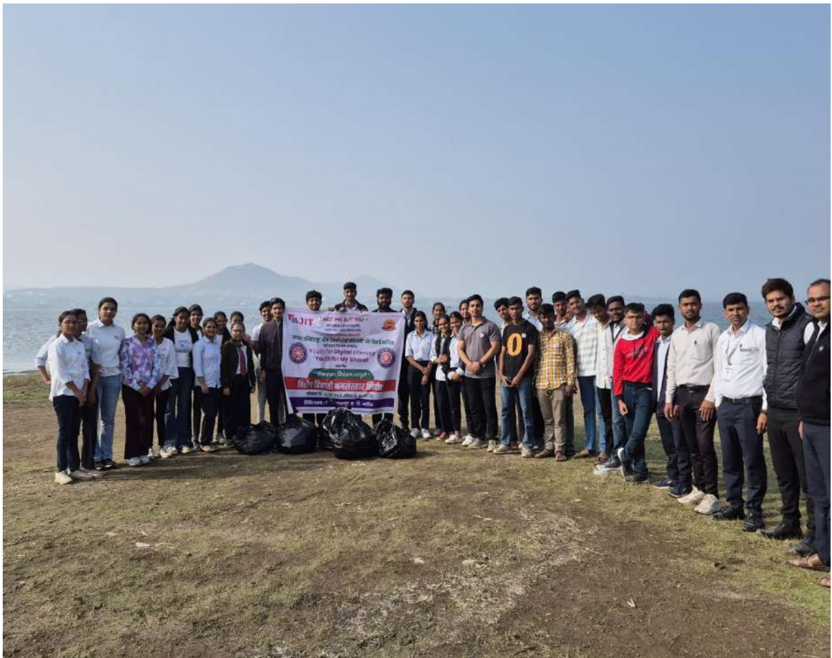
Student Volunteers Collect plastic bags and Bottle from Gangapur water dam area.