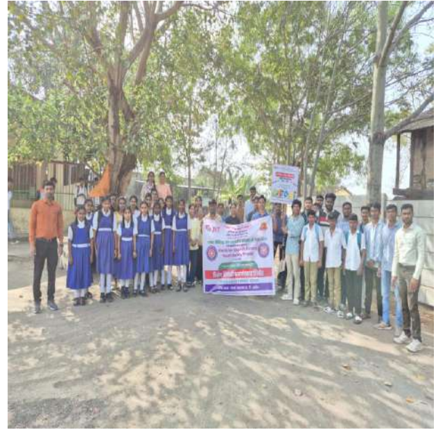
Importance of Education rally