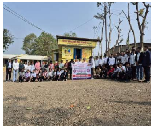
NSS Students With Chief Guest, Guest, Principal, NSS Po and teachers