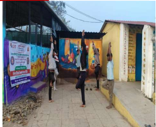
Morning yoga and exercise