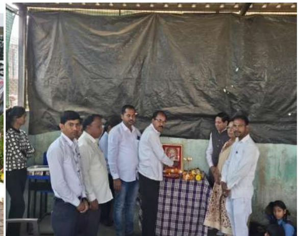
Inauguration Ceremony by taking blessing of Mata Saraswati