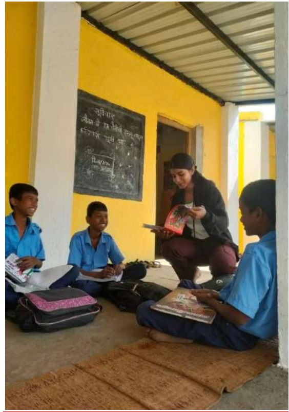
NSS Volunteers Guided the students of Zilla Parishad school