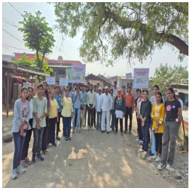
Beti Bachao Beti Padhao and Voters Awareness Rally in Village.