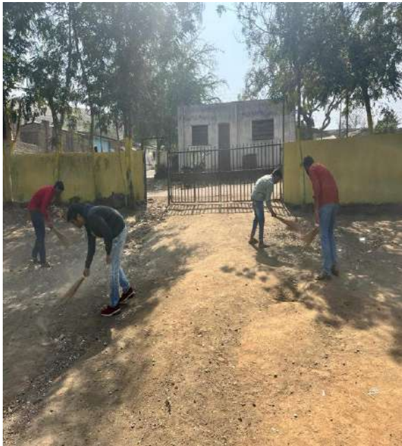
Cleaning Z.P.School Premises