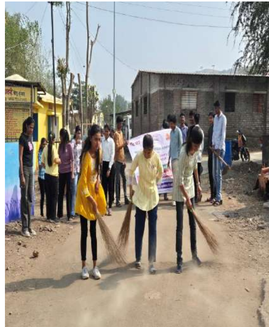
Cleanliness Drive conducted in Village